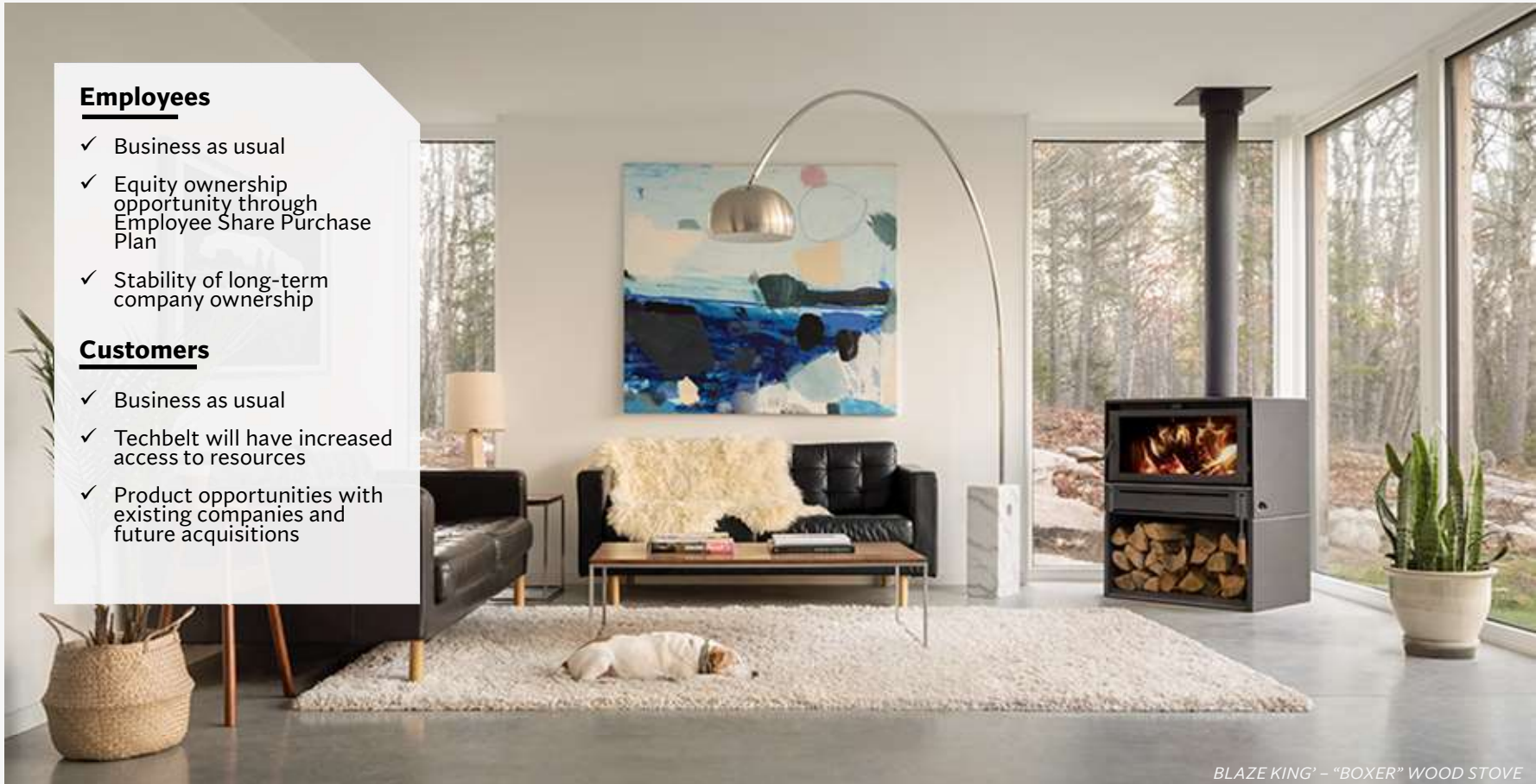
BLAZE KING® – "BOXER" WOOD STOVE