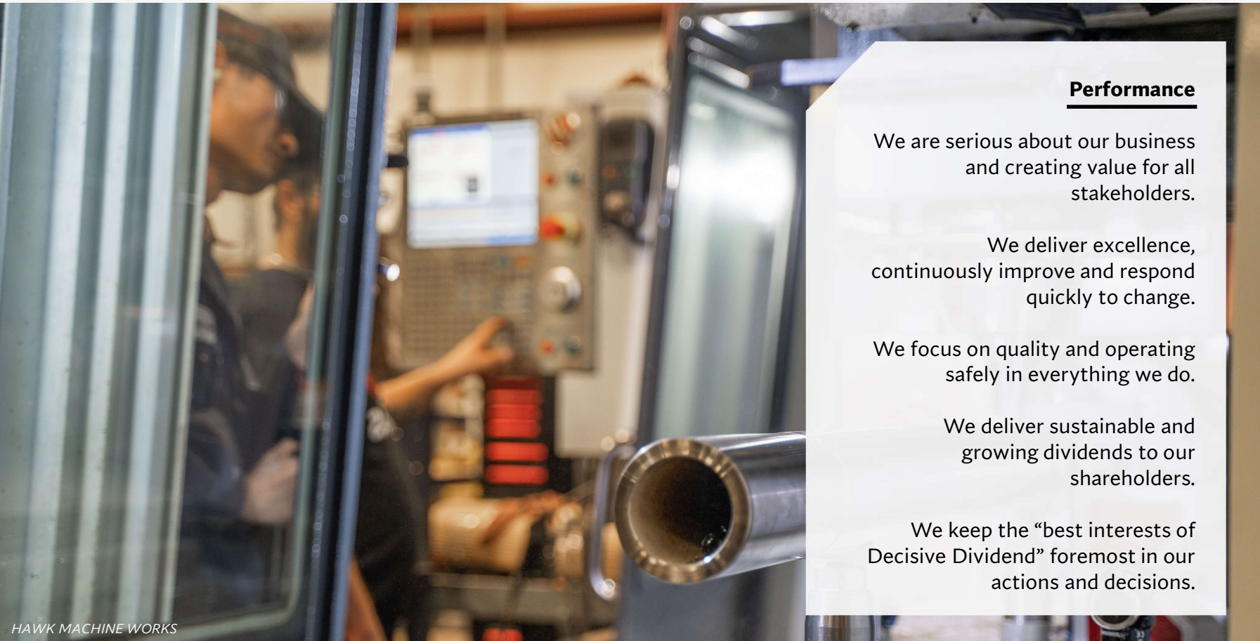
HAWK MACHINE WORKS

We keep the “best interests of Decisive Dividend” foremost in our actions and decisions.